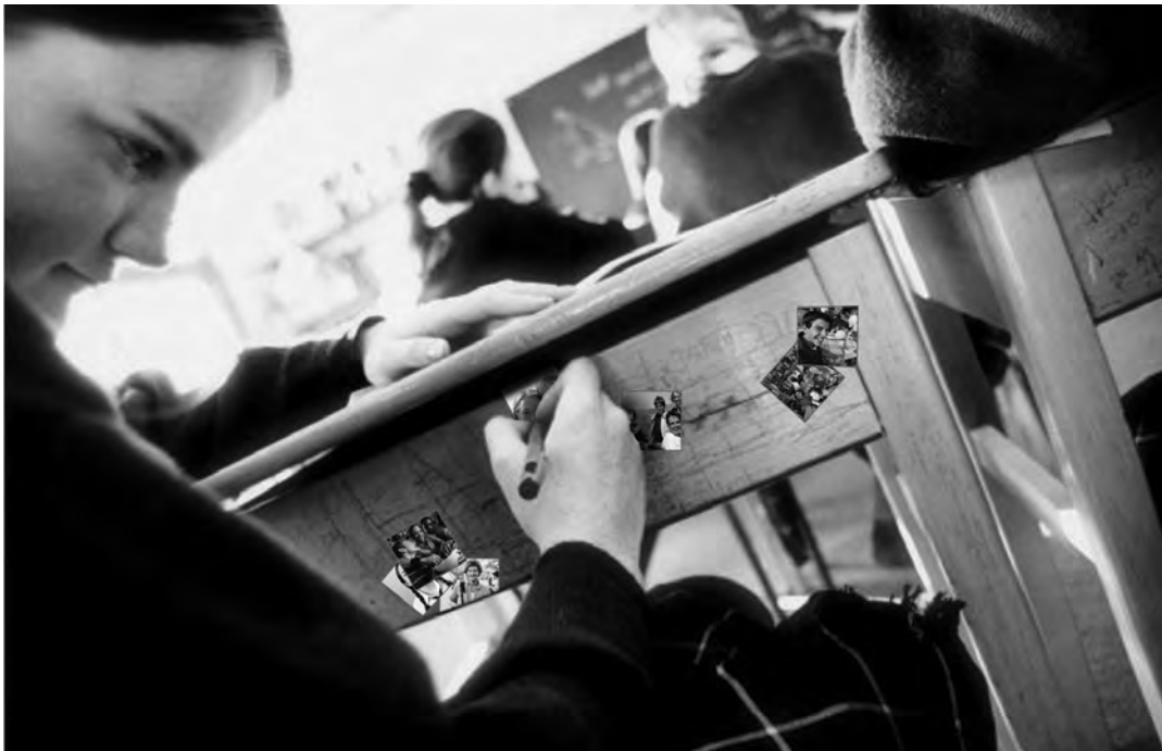
Stickpix was a service concept that allowed users to send images taken with their mobile phone in order to receive those pictures back as stickers they could stick anywhere. This image is one of a series of images that were mocked up to visualize how the service might come to life at various touch-points of a consumer's journey.

Prototype extreme service propositions early to stretch the organizational mindset. Quick, low-cost mock-ups allow emerging ideas to be expressed, explored, modified, and shared with customers, experts, and stakeholders in a very tangible and emotive way. They encourage informed decision-making more than a paper description could ever do, and they encourage the idea to continually evolve. Since they often deal with the intangible, service ideas may also require simulation or even the acting out of a scenario. For example, simulating a customer's experience of interacting with a service can be an invaluable tool.